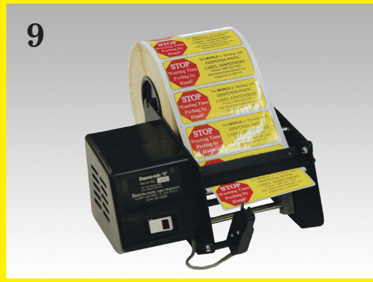
9. Dispensa-Matic "6-II" - for roll or fan-fold labels to 5.5" width. Does not wind up waste, and loads VERY quickly. Better for large diameter rolls, and where constant speed is needed. (6" per second advance.)

Bottle-Matic Is a perfect machine for labeling your cylindrical objects! Our machine will wrap your bottles, cans, tubes, and jars by simply pressing the foot-switch! We can even do tapered objects without customizing! Even if your can or bottle has ridges we can customize the rollers to work with them. Customizing your Bottle-Matic is charged per hour, and if we can't make it work, you pay NOTHING! Simply send your object to be labeled, and a roll of the labels to be applied.